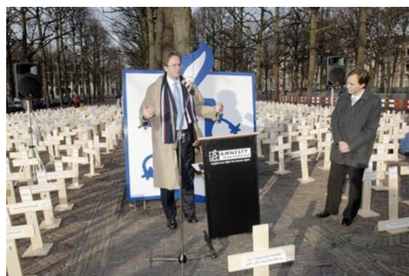
AI Netherlands demonstration in front of the US Embassy at the 1000 th execution in the USA