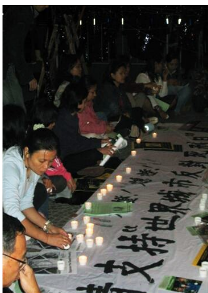
AI Hong Kong's vigil on for the "Cities of Life - Cities Against the Death Penalty" campaign