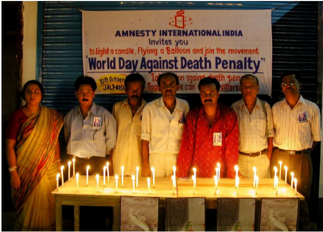
AI members in Jalpaiguri, West Bengal, India held a candlelight vigil on the World Day against the death penalty