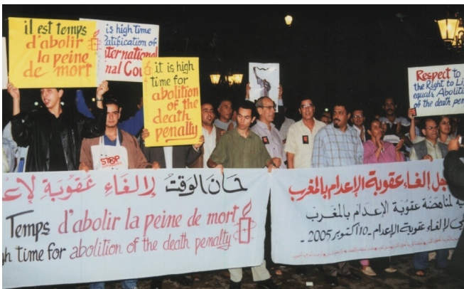
AI Morocco demonstrating, on the World Day with other NGOs, against the death penalty.