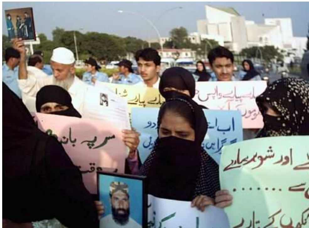
Protests against enforced disappearances in front of Supreme Court of Pakistan.

Official Supreme Court transcripts 27 obtained by Amnesty International, together with affidavits from people released following periods of enforced disappearance and communications from lawyers representing persons subjected to enforced disappearance show that government officials, particularly from the country's security forces, when called before the Supreme Court of Pakistan and the provincial high courts, resorted to a variety of means to avoid enforced disappearances being exposed. These tactics included denying detention takes place and denying all knowledge of the fate and whereabouts of disappeared persons; refusing to obey judicial directions; concealing the identity of the detaining authorities for example, by transferring the disappeared to other secret locations, threatening harm or re-disappearance and levelling spurious criminal charges to conceal enforced disappearances. But the sources cited in this report point to the identity of the detaining authorities and to several locations where people are believed to be secretly detained. A dangerous lack of accountability for acts committed by the intelligence services is also highlighted in these sources, together with evidence of pressure put on the judiciary not to use all its powers to provide redress.