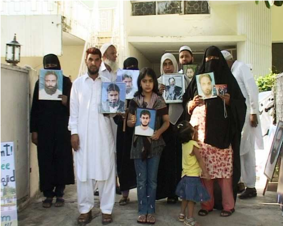
Relatives of victims of enforced disappearance, protesting outside HRCP Islamabad office, 29 September 2006