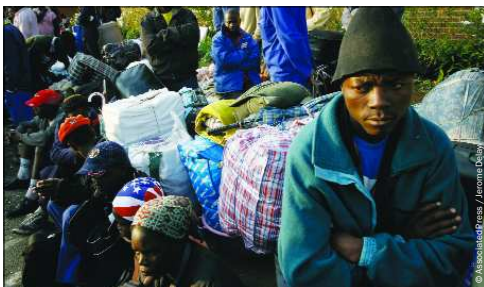
Mozambicans displaced from their South African homes wait for a bus to take them back to their country.

Amnesty International has called on the South African government to take all necessary measures to protect the human rights of people displaced by the violence. All those affected should have access to humanitarian assistance, legal remedies, counselling support and full and fair asylum procedures, and repatriation must be voluntary.