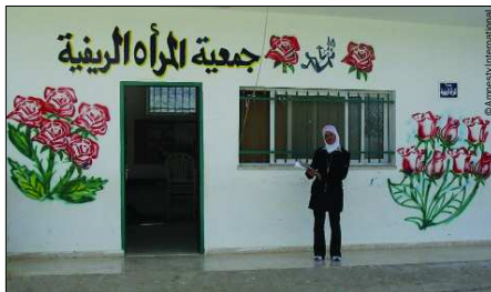
Palestinian women's NGO and kindergarten threatened with demolition in 'Aqaba village in the Occupied West Bank.

People in 'Aqaba, a small Palestinian village in the occupied West Bank, have long lived with the fear that their homes may be demolished.