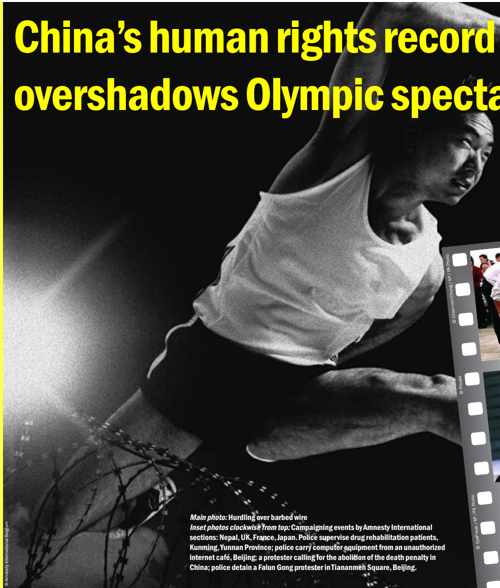
Main photo: Hurdling over barbed wire Inset photos clockwise from top: Campaigning events by Amnesty International sections: Nepal, UK, France, Japan. Police supervise drug rehabilitation patients, Kunming, Yunnan Province; police carry computer equipment from an unauthorized internet café, Beijing; a protester calling for the abolition of the death penalty in China; police detain a Falun Gong protester in Tiananmen Square, Beijing.