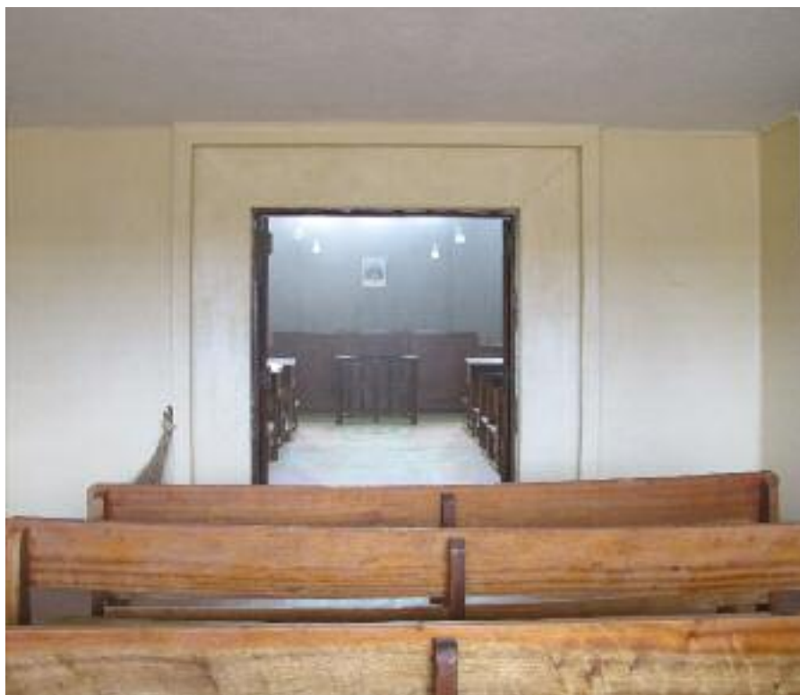
Left: A court room in Bukavu, eastern DRC, March 2011.