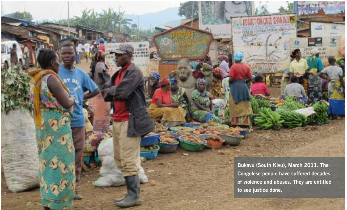
Bukavu (South Kivu), March 2011. The Congolese people have suffered decades of violence and abuses. They are entitled to see justice done.