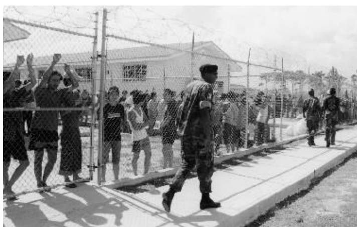
Soldiers patrol the inside of the Carmichael Detention Centre.

Amnesty International is very concerned at reports that some detainees at the Carmichael Detention Centre have allegedly been victims of physical or, in some cases, sexual abuse whilst in detention. Amnesty International interviewed detainees extensively at the centre and believes that the reports received are credible. Reports of ill-treatment were brought to the attention of the authorities who thus far have failed to respond to requests for information on investigations.