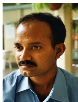
Nazmul Imam © AI