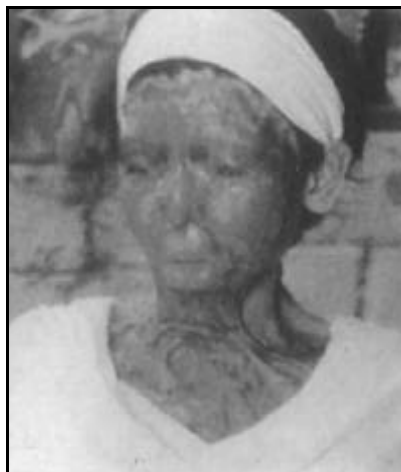
The injuries sustained by Fakhra.

A Pakistani monthly, The Herald commented, "the real tragedy, however, lies in the fact that there are scores of young women like her who continue to suffer and whose