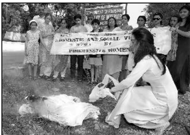
A women's rights activist burning bed sheets taken from hospital beds on which burn victims had recently died in Islamabad.