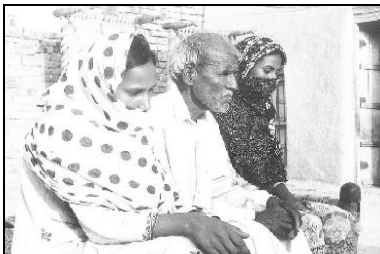
Christian girls who were raped on their way home