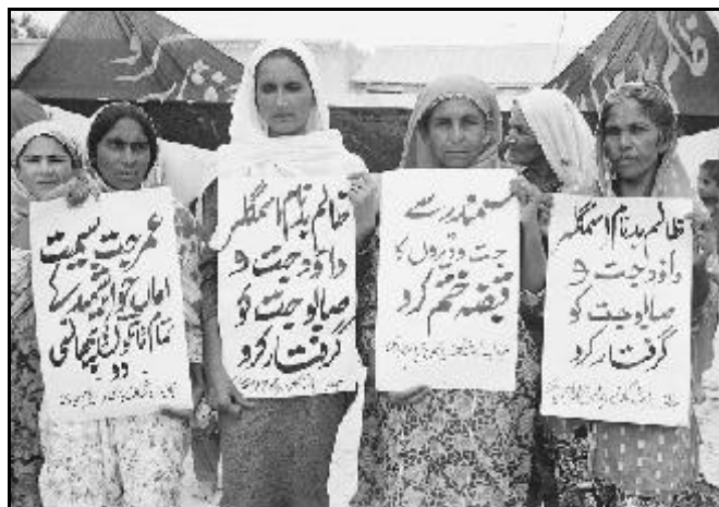
Women from the coastal areas of Karachi protesting about the killing of a local woman by smugglers.