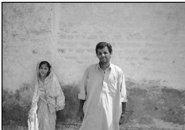
A six-year-old girl standing with her 26-year-old fiance. The child will be handed over to her bridegroom when she reaches the age of eleven or twelve.

and contacted a UK based lawyer who succeeded in obtaining emergency travel documents from UK authorities. The young woman returned to the UK in late August 2001.