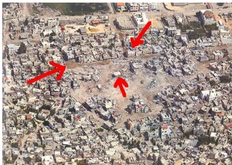
Jenin refugee camp – 13 April 2002