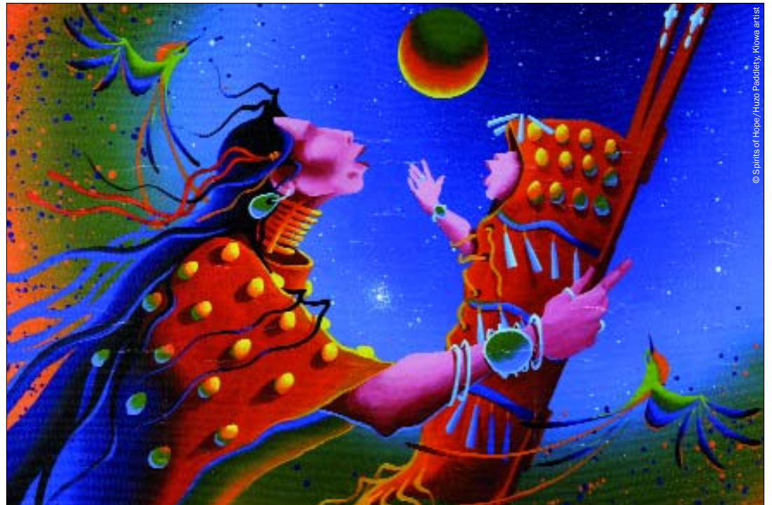
Poster produced by Spirits of Hope coalition. Spirits of Hope provides training to tribal and non-tribal programmes on domestic violence, sexual assault and stalking in Oklahoma Indian country, USA. It also provides counselling and referral services.