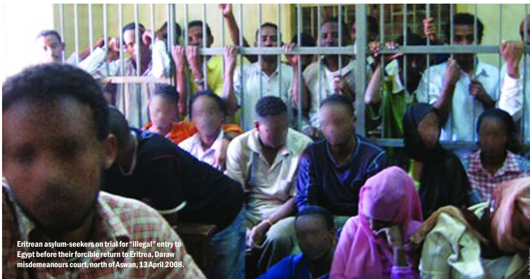
Eritrean asylum-seekers on trial for "illegal" entry to Egypt before their forcible return to Eritrea, Daraw misdemeanours court, north of Aswan, 13 April 2008.