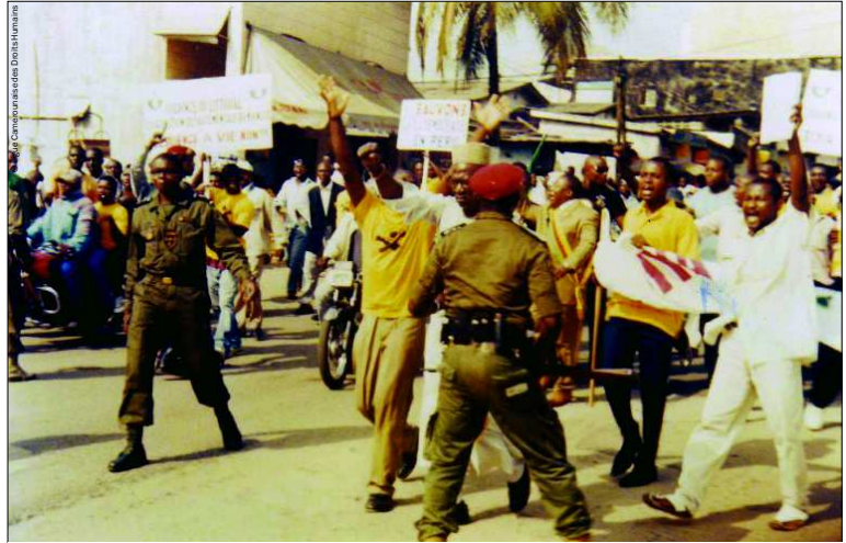
Security forces clash with demonstrators in Douala, February 2008. As many as 100 people were killed as riots erupted in many parts of the country in response to the rising cost of living and low wages.