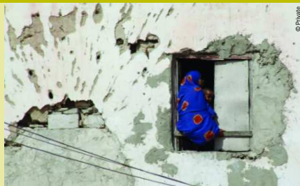
A woman and child try to avoid the shelling on the opposite side of their building, Hamar Bile, Somalia, 20 February 2007.

In October 2008, governments around the world will have the chance to begin a negotiating process for an urgently needed global Arms Trade Treaty (ATT).