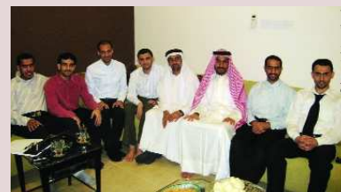
Eight Bahraini nationals returned home after their 134-day detention in solitary confinement in Saudi Arabia, July 2008.

Eight Bahraini men were released without charge in Saudi Arabia on 12 July 2008, after over four months in detention.