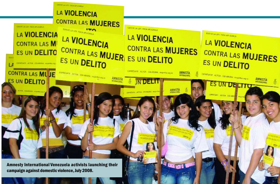
Amnesty International Venezuela activists launching their campaign against domestic violence, July 2008.