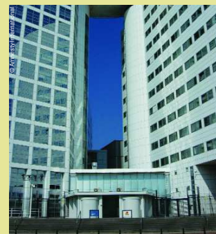
The International Criminal Court (ICC) at The Hague, Netherlands.

Calling the arrest a major victory, Amnesty International urged the UN to give the Tribunal the resources and time it needs to secure justice for all the victims of crimes committed in the conflict in the former Yugoslavia. In particular, the current deadline of 2010 might cut short the cases of two indicted war criminals still at large - Ratko Mladić and Goran Hadžić.