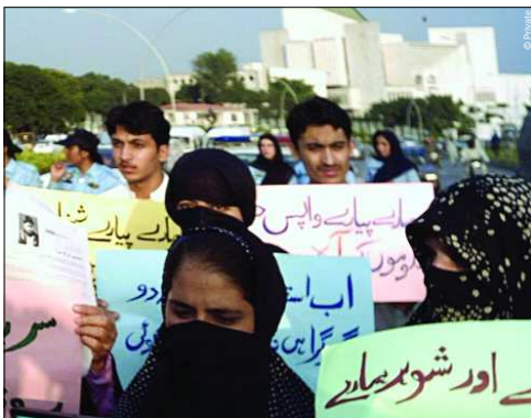
Protesters demonstrating against enforced disappearances in front of the Supreme Court of Pakistan, September 2006.

For further information, see: Denying the undeniable - enforced disappearances in Pakistan (ASA 33/018/2008). For further information on Masood Ahmed Janjua: www.amnesty.org/en/library/info/ASA33/020/2008/en