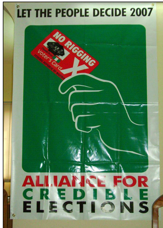
Poster from ACE, a coalition of local NGOs.

The months leading up to the April 2007 elections show a similar pattern: politically motivated acts of violence, harassment and intimidation of political opponents have been reported throughout the country, and appear to be particularly prevalent in the Niger Delta region. 5 As during the 1999 and 2003 elections, many local and state politicians have instigated