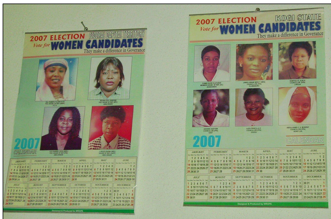
Calendar with women candidates.

Women prospective candidates, already an under-represented group in the 2007 elections, have reported several cases of threats, harassment and intimidation by their opponents. The Minister of Women's Affairs and Social Development, Inna Maryam Ciroma, stated in an interview that Nigerian women are hindered from participating in politics because of the political violence and discrimination related to the elections. 24