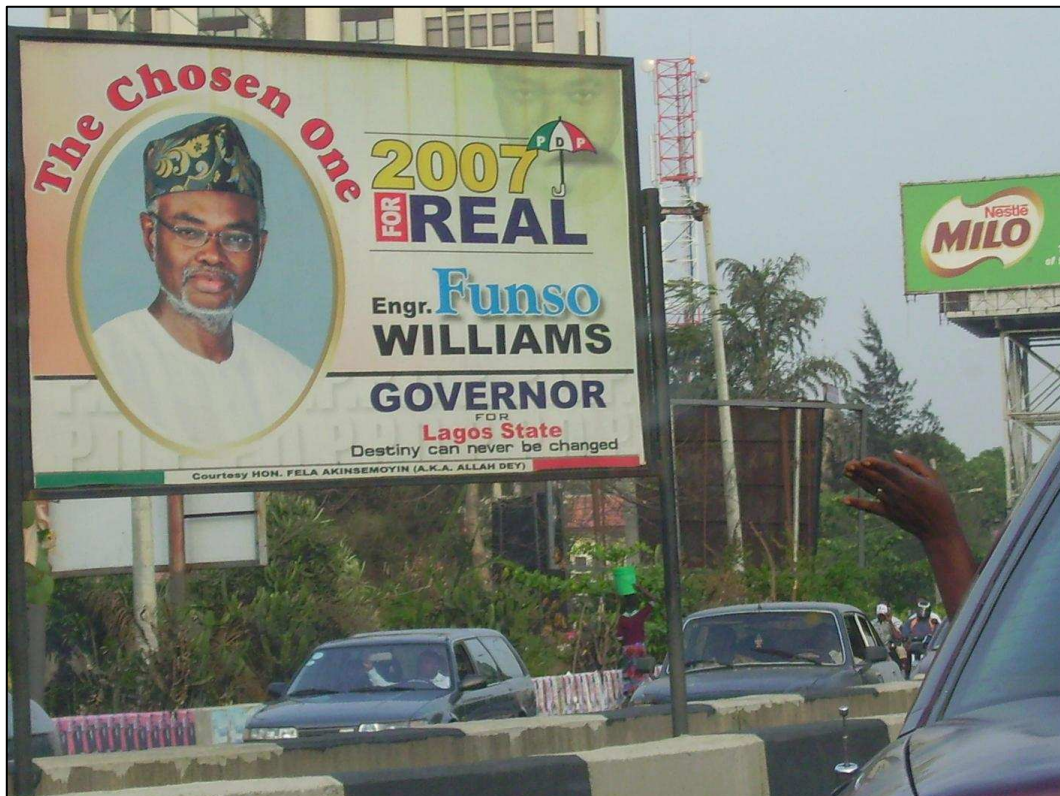
Electoral poster of candidate F. Williams, killed in July 2006 .