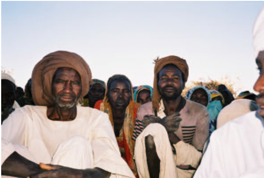
A group of Masalit refugees met by Amnesty International delegates in Eastern Chad

Amnesty International delegates visited several sites around Adre in Chad where people from Sudan had taken refuge. The refugees were predominantly of Masalit origin and fleeing attacks on their villages in rural areas around al-Geneina, capital of West Darfur.