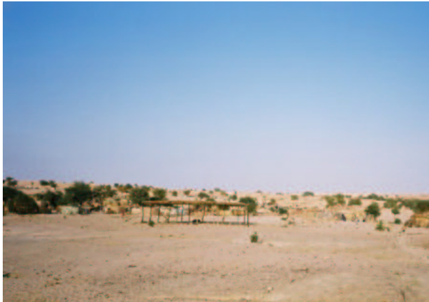
Large hut built by the refugees in Tine 2 as a school for their children

education systems in Sudan and Chad were too different. In camps around Adre, parents and students who had fled to Chad also raised concerns at the absence of education facilities for them. They all stressed that they saw the provision of education for children and students as a priority.