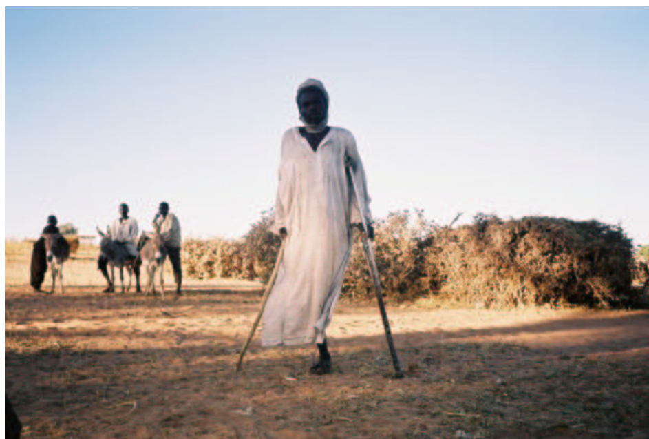
A handicapped Sudanese refugee who fled an attack on his village in Darfur

« Some of us came here, others fled to Silaya town in Sudan. We went back to the village after the attack to bury our dead and all the survivors had fled. It took us three days to come to Chad. We had to hide during the day and travel at night. There were soldiers and Arab militias all along the road. »