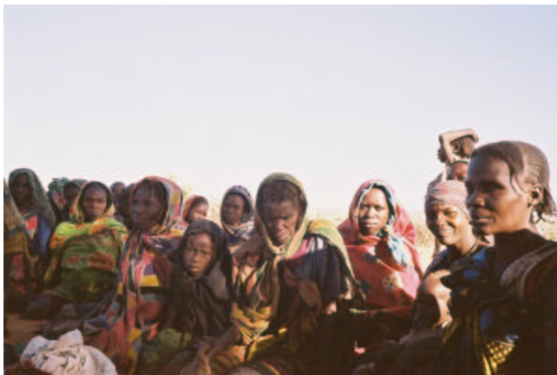
A group of refugee women from Darfur met by Amnesty International delegates in Chad

In some instances, women found on roads or in the bush while collecting wood, travelling or fleeing attacks were raped.