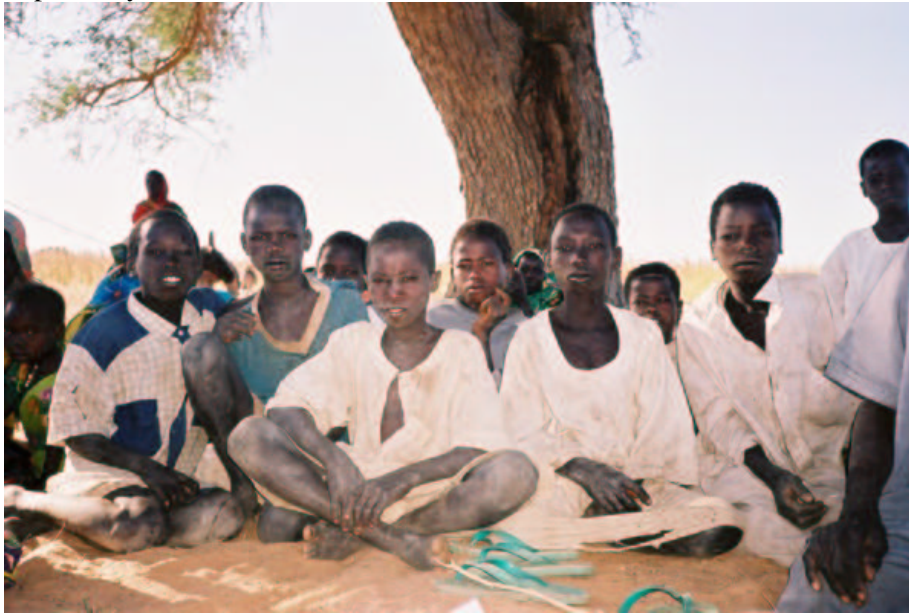
Group of refugee boys around Adré

Many refugees have also highlighted the difficulties faced by their children, most importantly the lack of education facilities.