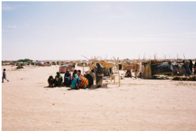
Makeshift refugee shelters in Tine 1

Although the refugees were welcomed by the local population, who have shared their limited means of subsistence with them for more than seven months at the time of writing, most of them still live in precarious conditions. Amnesty International delegates visited eight locations where refugees were living : Tina 1, Tina 2, Birak, and Adre, Birkengi, Nakuluta, Kolkol and Agan. In Tina 1, the refugees were living in huts made out of fabrics and sticks found in the area. In other locations, they were living in precarious shelters made out of dry branches they could find in this semi-desert region.