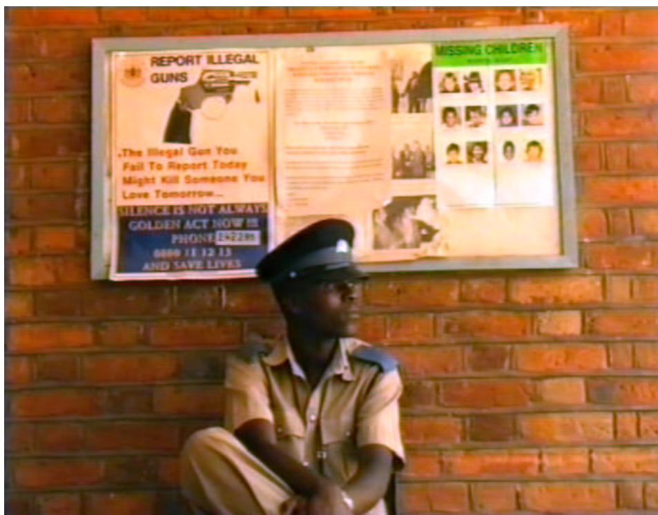
A police officer, Malawi. From a video on community safety and firearms control.

UN Basic Principle 24 states: “Governments and law enforcement agencies shall ensure that superior officers are held responsible if they know, or should have known, that law enforcement officials under their command are resorting, or have resorted, to the unlawful use of force and firearms, and they did not take all measures in their power to prevent, suppress or report such use.” 83