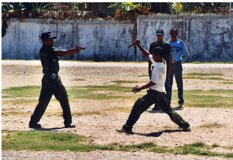
Timor-Leste Police Service Training on how to use pistols. Police Academy, Dili, October 2002

about 3,000 began to be set up in April 2001, mostly armed with modern Glock 9mm pistols, but not all. 35