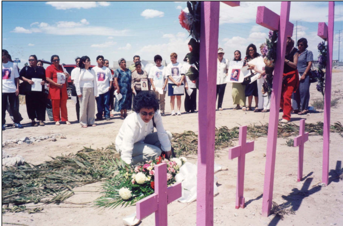
Irene Khan at memorial site

External December 2003 AI Index: ACT 60/009/2003