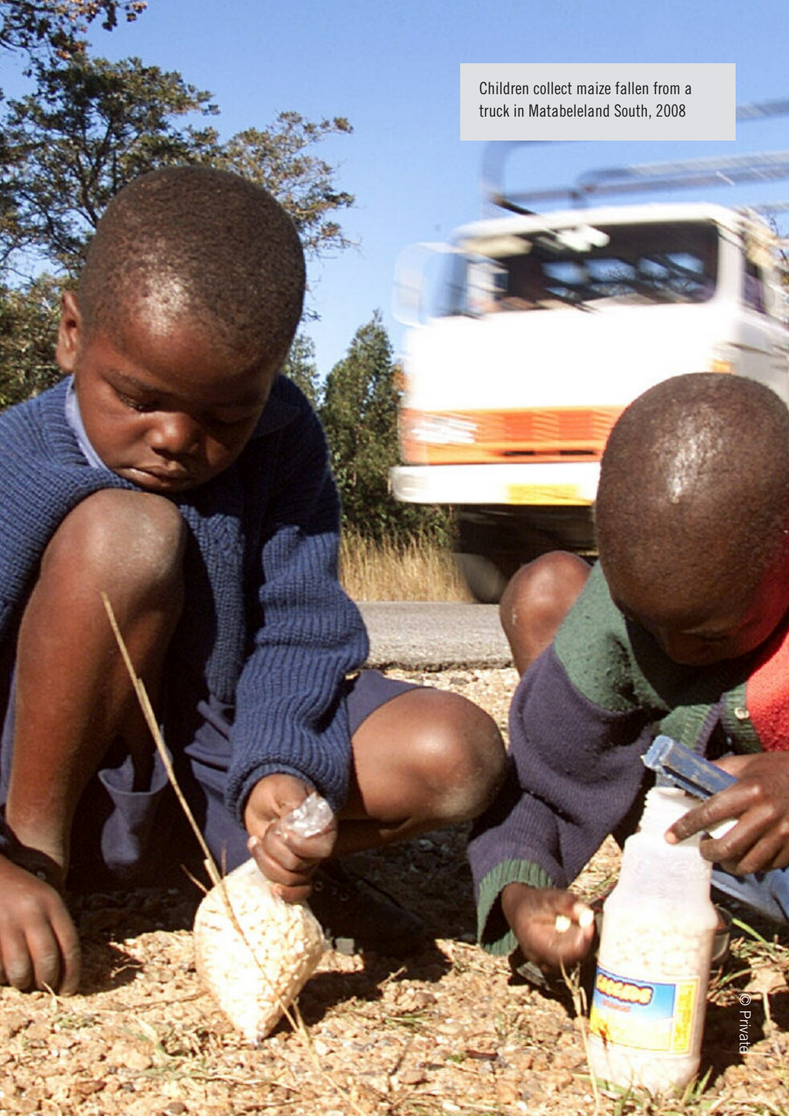
Children collect maize fallen from a truck in Matabeleland South, 2008