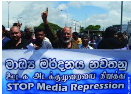
Media associations demonstrate in Colombo, Sri Lanka, December 2007

A total of 171 journalists and media workers were killed in 2007, according to the International Federation of Journalists, slightly below the 2006 figure of 177. Sri Lanka and Somalia were among the most dangerous countries for working journalists last year, with killings, intimidation and other abuses a constant threat.