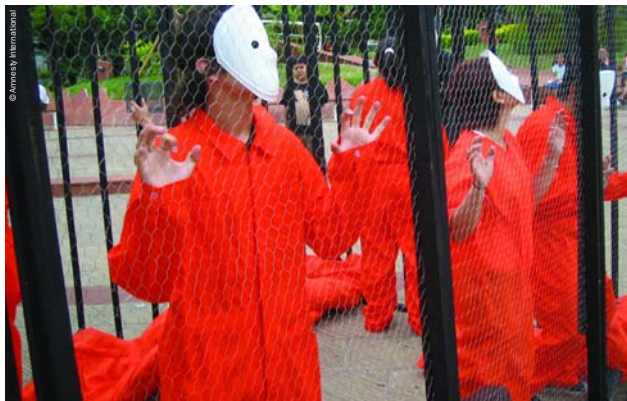
Amnesty International supporters in Asunción, Paraguay, draw attention to the plight of Guantánamo detainees