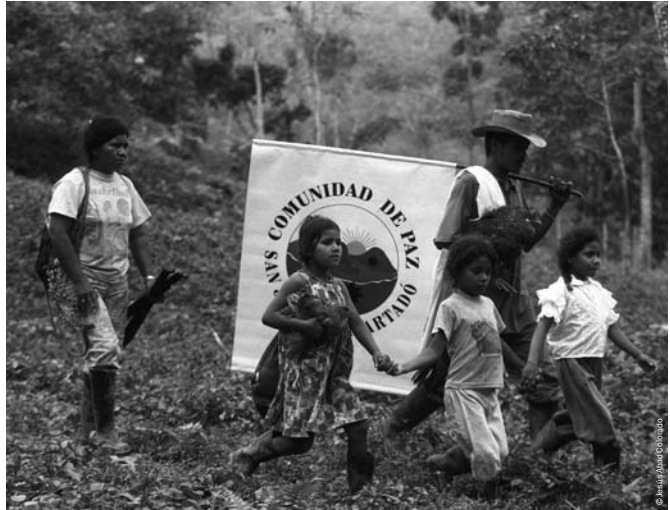
Over 160 members of the Peace Community of San José de Apartadó have disappeared or been killed since 1997.

For more than 10 years the Peace Community has tried to exercise its right not to be drawn into the conflict. But, by insisting that security forces remain outside San José de Apartadó and the surrounding hamlets, the community has been accused of hindering the security forces, trying to create an independent state, and even acting as a smokescreen for guerrilla forces. This is despite the fact that guerrilla forces have themselves criticized the community's stance.