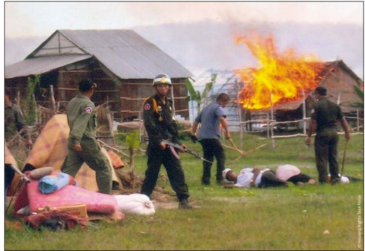
Mittapheap 4 villagers try to protect themselves as security forces burn their homes and ransack their belongings. The brutal eviction, which made over 100 families homeless in one day, was captured on mobile phone, 20 April 2007.