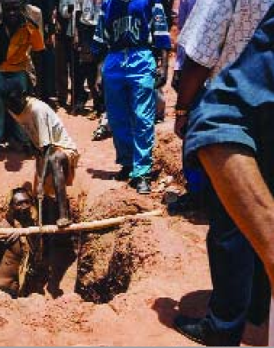
mine-shaft at a state diamond concession,