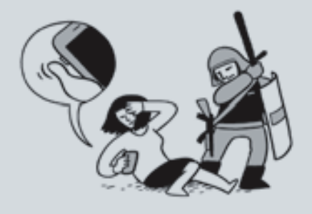
CHECK you are ready and that your mobile phone has credit and battery

ACTIVATE Panic Button in an emergency by rapidly pressing the phone's power button