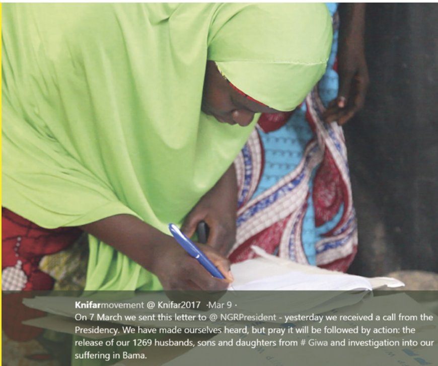
Knifarmovement @ Knifar2017 · Mar 9 · On 7 March we sent this letter to @NGRPresident - yesterday we received a call from the Presidency. We have made ourselves heard, but pray it will be followed by action: the release of our 1269 husbands, sons and daughters from #Giwa and investigation into our suffering in Bama.