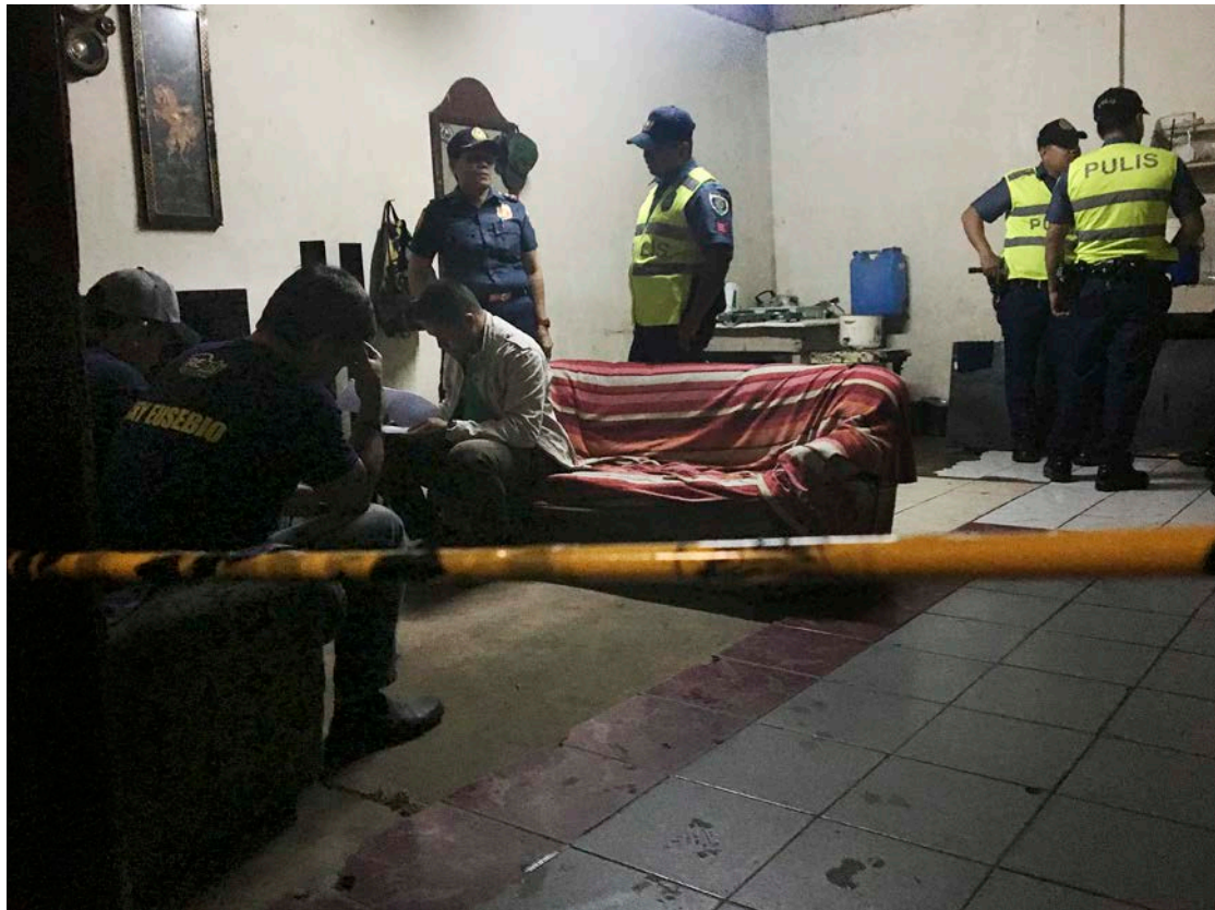
Policemen wait on the ground floor of a house where four people were killed by unknown armed persons in an alleged “drug den,” 12 December 2016, Pasig City, Metro Manila. Crime scene investigators had not arrived yet to work the case—one of two incidents documented by Amnesty International delegates observing journalists’ night-shift coverage of police activities.

Tokhang, Ampo-an had surrendered as a user to the Eastern Police Station. A family member told Amnesty International, “People are being killed like chickens now. You just cut their throat and let them die.” 213