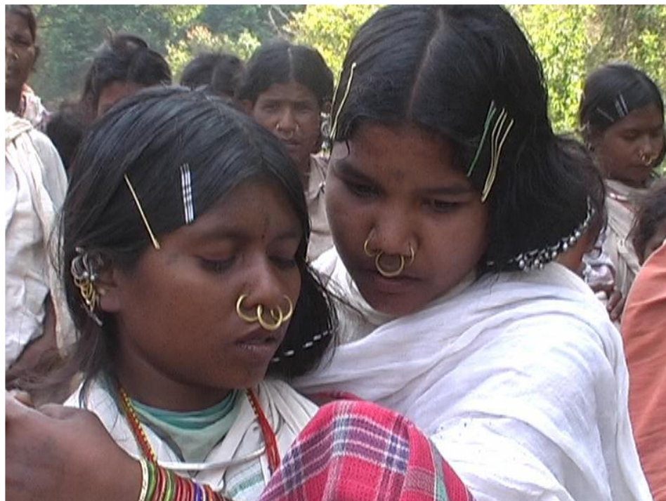
Photo: Dongria Kondh women at a protest meeting, Niyamgiri Hills