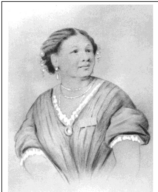
Mary Seacole, whose “wonderful adventures” were first published in 1857.

It also gave rise to the adoption of the Nuremberg Code 8 and to the priority given to