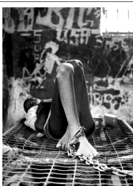
Sierra Leone. The 'Kissy Home' psychiatric hospital in Freetown is the only such facility in a country which has been estimated to have 100,000 people suffering from severe psychological problems. Patients can be chained to their beds or to the floor, where they sit in their own excrement. Treatment is only available to those whose families can pay for it.

In 2002, the NGO Mental Disability Rights International (MDRI) received reports concerning cases of sexual harassment, exploitation, rape, or other forms of violence at three institutions in Kosovo. 393 The management of the institution and UN authorities were informed about cases of abuse at a facility for people with mental disabilities; however, known abusers had not subsequently been removed from day-to-day contact with former victims. At Pristina University Hospital, MDRI had also received reports about sexual abuse of women by staff. A year later, MDRI continued to express concern at the lack of progress in effectively addressing abuses. The same organization has published reports on abuses of people in institutions in several other countries. 394 A common thread in these reports is the shortage of well-trained and equipped staff, including nurses.