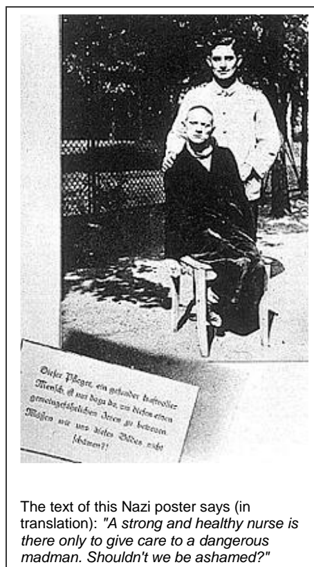
The text of this Nazi poster says (in translation): "A strong and healthy nurse is there only to give care to a dangerous madman. Shouldn't we be ashamed?"

Other nurses involved in the euthanasia programme acquiesced in the organized killing while at the same time maintaining a moral rejection of murder. As one nurse commented, "If I had been told to hit a patient with a hammer on the head, then I would have known that it was murder, and I would have refused under all circumstances to do it." 14 Another nurse said, "Because I saw no connection [between taking patients into the 'death chamber' and their subsequent killing], it never occurred to me to refuse." 15