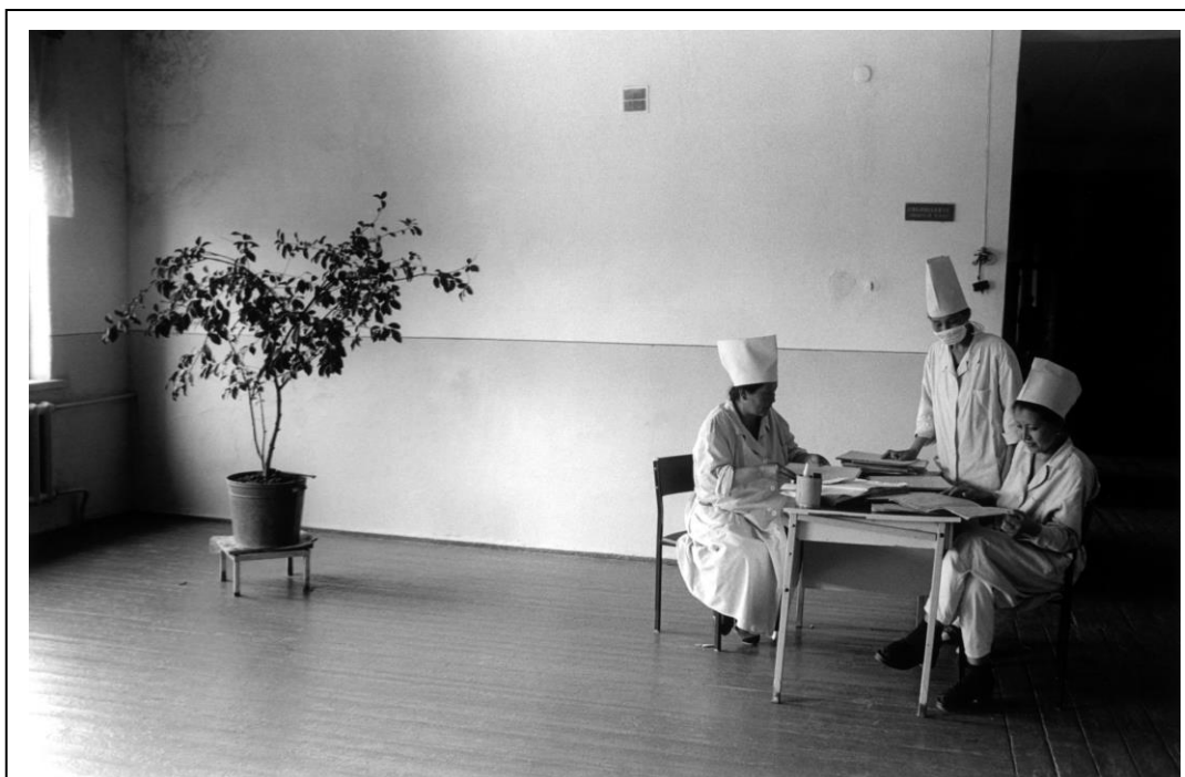
Nurses in the tuberculosis hospital in Nukus in the Karakalpakstan region of Uzbekistan which has the highest levels of tuberculosis in the former Soviet Union.

The World Health Organization reported in 2005 that 182 countries employed DOTS strategies during 2003, and that as a result of such strategies, global TB prevalence fell globally by 5% between 2002 and 2003. The same report noted that in 2003, global TB prevalence was falling or stable in five out of six WHO regions, with the exception of the Africa region, where incidence had been rising more quickly in areas of HIV prevalence. The