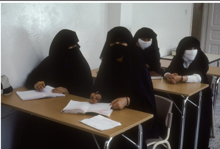
Yemen. Training of village midwives at the regional hospital in Ibb, 2000. Yemen became the third country in the Middle East region to implement a leadership and management training scheme for nurses run by the Central Nursing Directorate with the cooperation of the International Council of Nurses (ICN) in Geneva, and supported by World Health Organization (WHO). The first 29 students graduated in April 2006

International human rights law – specifically the UN Convention against Torture – also obliges governments to ensure that education on torture is included in the training of health professionals, including nurses, whose work frequently brings them into contact with people who have been detained against their will and who may thus be at risk of human rights abuses. 421 Education on this theme should also take into account that virtually any health professional may find themselves working with a patient who has been tortured or otherwise ill-treated.