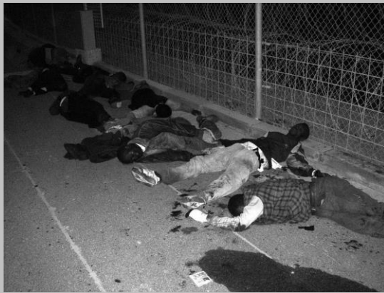
Scene at the Spanish/Moroccan border after those pictured had attempted to cross the fence at Ceuta, 29 September 2005 Picture published in La Razon , 29 September 2006 © Private