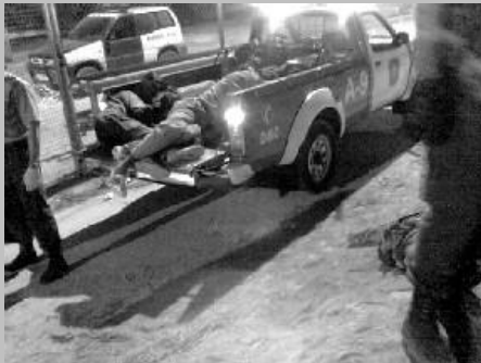
Migrants being removed by the Spanish authorities from the area between the two fences at Melilla, September 2005.

security forces waiting on the other side. These actions contravene international standards and Spanish law. 42