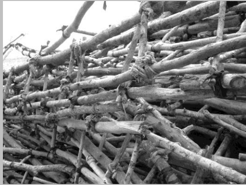
Makeshift ladders abandoned near the border fence, 2005.