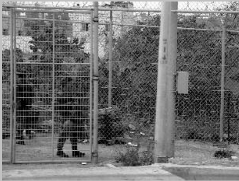
Spanish soldiers patrol behind a gate in the fence at Melilla, Spain, 2005.

This lack of legal clarity has facilitated a number of human rights violations. When people are intercepted by Spanish Civil Guards in the area between the two border fences, they are often immediately unlawfully expelled through one of the gates in the fence closest to Moroccan territory. At no point do they have the opportunity to obtain legal advice nor are they given access to an interpreter as required by Spanish law. In many cases, people have been stopped by Spanish Civil Guards improperly using riot-control weapons or firing shots into the air. Testimonies obtained by Amnesty International describe how Spanish Civil Guards beat people with their rifle butts or shoot at them with rubber bullets from very close range before confiscating their clothes or shoes and handing them over to the Moroccan