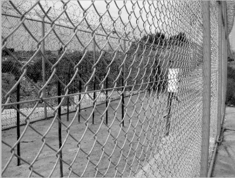
The area between the border fences, 2005.