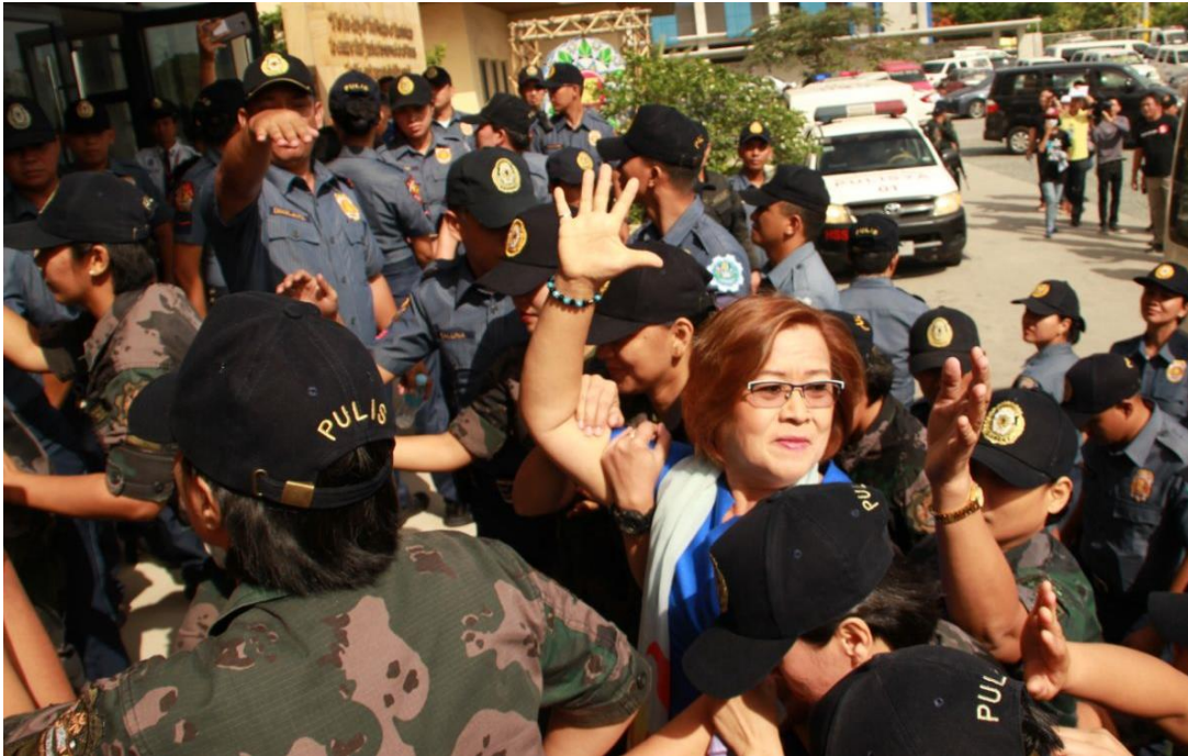
Detained Senator Leila de Lima waves to supporters and the media as she attends a court hearing in Metro Manila