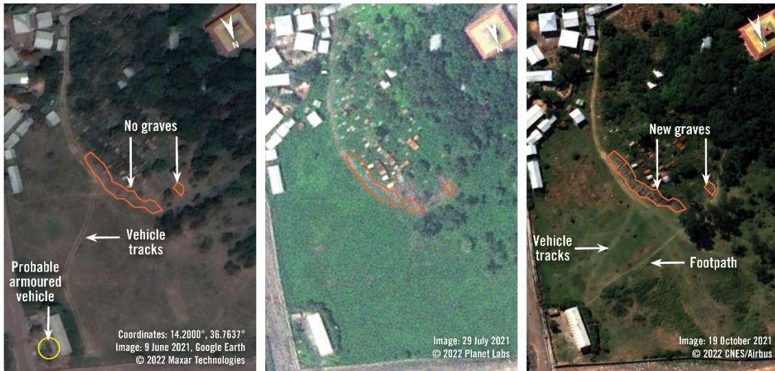
Satellite imagery from 9 June, 29 July and 19 October 2021, shows the St. George's Church graveyard area in Kobo, Ethiopia. On 19 October 2021, many new graves are visible that were not apparent in the previous imagery in the exact location where witnesses told Amnesty International they had buried some of the civilians summarily killed on 9 September.

Satellite imagery analysis by Amnesty International’s Crisis Evidence Lab shows evidence consistent with new burial sites at the St George’s and St Michael’s churches compounds, where residents told Amnesty International that they had buried those killed on 9 September.