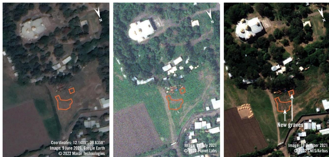
A time series of satellite imagery shows the increase in graves at St. Michael's church graveyard, where witnesses told Amnesty International some of those summarily killed on 9 September were buried. On 9 June 2021, new graves are not visible. On 29 July 2021, imagery shows a small area of possible disturbed earth but it is not clear if they are graves. On 19 October 2021, imagery clearly shows an increase in graves.