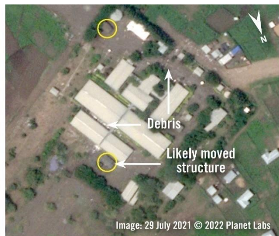
Satellite imagery from 9 June and 29 July 2021 shows the Kobo hospital. On 29 July, debris is visible in the area consistent with reports that the hospital buildings had been ransacked.