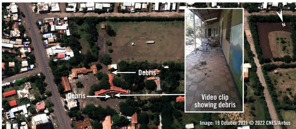
Satellite imagery from 9 June and 19 October 2021 shows St. Joseph’s School. On 19 October 2021, small areas of debris are visible consistent with a video showing areas of the school ransacked and with residents’ testimonies. The debris may have been present on 29 July, but the resolution of the image is not high enough to see the subtle debris. Video source: Uploaded 14 December 2021, https://www.facebook.com/watch/?v=598507934537401 , accessed 4 February 2022. (The 9 June image shows the presence of many lorries, buses and military trucks, indicating the presence of government forces and/or allied militias around the school prior to the arrival of Tigrayan forces in Kobo. Government forces were also using the school in early February 2022 according to witnesses).