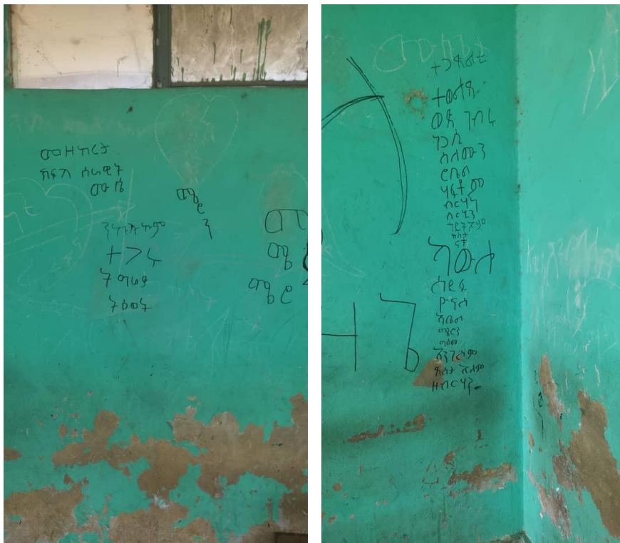
Writing on the wall of the Ewket Chorra school in Kobo, in the Amhara region of Ethiopia, says "Memorial of Moses Division. For all Tigrayans, (Tegar), Tigray will prevail". The school was being used as a military camp by Tigrayan forces when they controlled the town last year, and was left ransacked and vandalized.