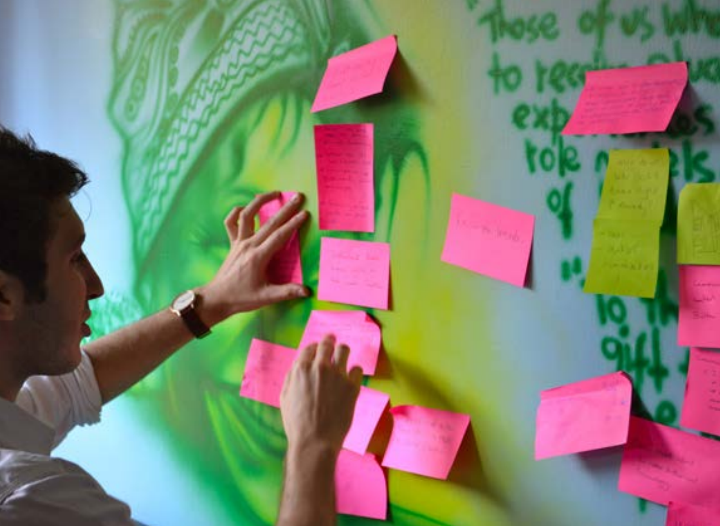
(Above) A Technology and Human Rights design workshop takes place in Kenya, Nov 2012