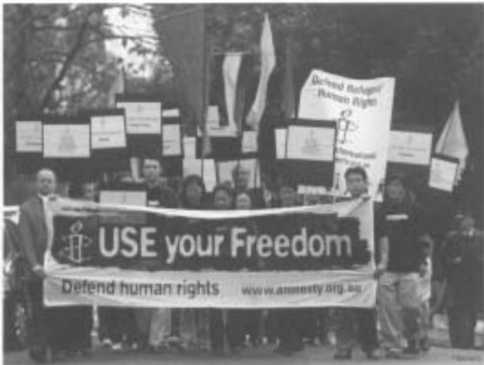
AI members from 22 countries in Asia take part in a march to Australian Prime Minister John Howard's residence in Sydney, July 2003. Demonstrators demanded the release of child refugees and asylum-seekers held in Pacific island camps.

sought to pave the way for premature returns of Afghan and Iraqi refugees and asylum-seekers, despite the fact that security and human rights conditions were far from conducive to return. AI expressed concern about the timing of returns and whether they were, or would be, voluntary and sustainable. AI emphasized in particular that where conditions in a country change as a result of the violent overthrow of a regime, safety, security and human rights conditions should be even more cautiously assessed precisely because it is so difficult to make accurate assessments of the durability of change.