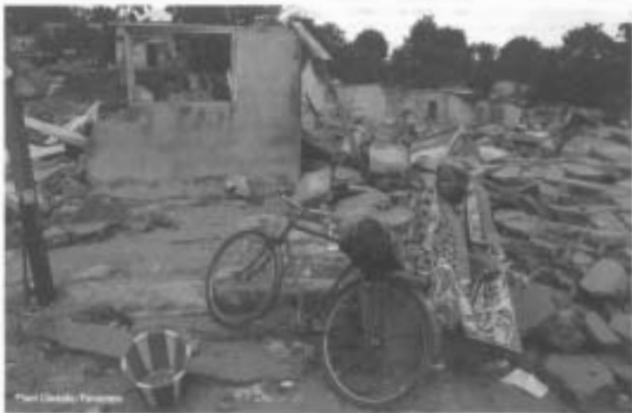
A woman in Côte d'Ivoire whose house was destroyed in the conflict which erupted in September 2002.

For example, following recent changes in government in Afghanistan and Iraq, some states