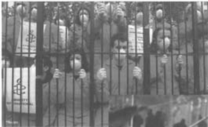
AI members stage a protest outside the residence of UK Prime Minister Tony Blair during a visit by US President George W. Bush in November. Demonstrators sought to highlight violations of the fundamental human rights of hundreds of detainees held by the US authorities in Guantánamo Bay, Cuba. (Inset) A US soldier watches over prisoners in Guantánamo Bay.

legislation and practices affecting prisoners, the administration of justice, the reconstruction of the police force and the rights and status of women. In its 2003 report Afghanistan: "No one listens to us and no one treat us as human beings" – Justice denied to women , AI stressed the need for measures to protect the rights of women to be built into legal and constitutional reform and integrated into policing and criminal justice processes. An AI delegation was present in Afghanistan in December at the time of the meeting of the Constitutional Loya Jirga (CLJ) in order to press CLJ delegates for a constitution fully consistent with international human rights standards. AI wrote an open letter to President Karzai raising a number of issues concerning the draft constitution, including, for example, the rights of women.