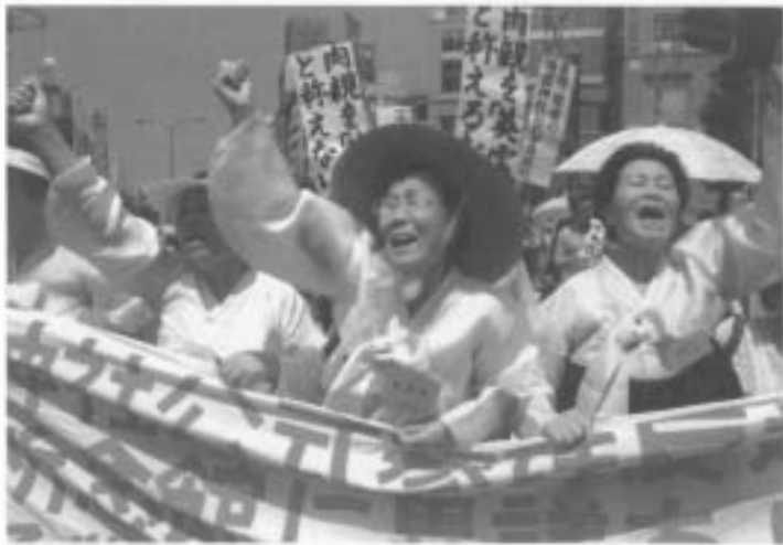
South Korean former "comfort women" used as sex slaves by the Japanese Imperial Army during the Second World War demand compensation and redress.

AI is also seeking to bring to public attention the effect on women of the widespread arrest and