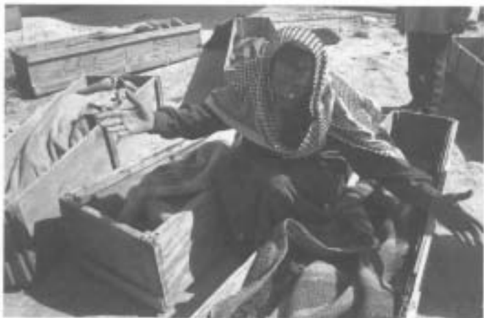
A father cries over the bodies of his children in al-Hilla, Iraq, April 2003. Survivors of the attack on al-Hilla described how the explosives fell "like grapes" from the sky. The use of cluster bombs in al-Hilla by US/UK forces may have amounted to indiscriminate attacks and therefore a grave violation of international humanitarian law.

endemic. Identity issues can trigger conflict, but poverty and, paradoxically, mineral wealth, are more often harbingers of internal conflict. Conflicts over resources, fuelled by discrimination, continue, especially in poorer countries, and the number of situations in which weak states are confronted by economically powerful armed groups may increase.