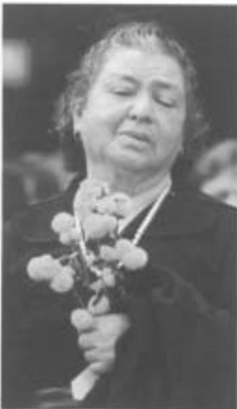
A demonstrator from the Ruta Pacifica , a Colombian feminist peace movement, during a minute's silence for the dead in Colombia's war.

2003 witnessed the harassment, arrest, torture, "disappearance" and killing of human rights defenders around the world. Those targeted included campaigners seeking to compel governments to deal with gross inequalities in the distribution of wealth, access to basic health facilities, education, water and food. Many fought to protect the environment and defend social, economic and cultural rights. Others were attempting to expose crimes against humanity, extrajudicial killings, "disappearances" or torture. Many were targeted because of their insistence on the need for democratic or judicial reform or their criticism of harsh security measures.