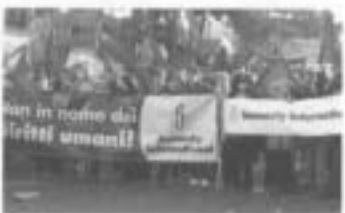
AI members in Senegal (far left) and Italy campaign for human rights in the build-up to the US-led invasion of Iraq in March.