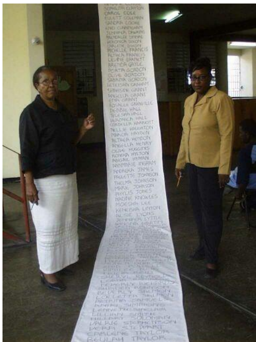
Women’s activists stand alongside a scroll with the names of the women and children murdered in 2004.

tacitly accepted, 15 many children carry weapons 16 and criminals enter schools to carry out attacks – most girls have witnessed violence at school 17 and many have been victims. 18