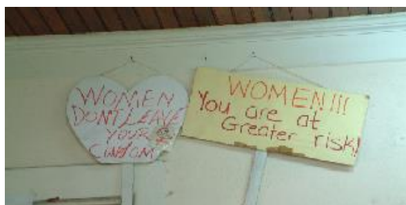
NGO placards encouraging safer sexual practices.

Other forms of violence against women also contribute. Tentative evidence suggests that women find it more difficult to negotiate condom use and to use condoms consistently with a violent partner 74 : “Women’s susceptibility to HIV is exacerbated by unequal power between women and men and the use of violence to sustain that power, which limits women’s ability to negotiate safe sex.” 75