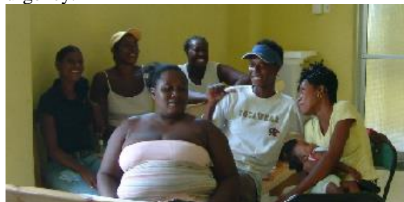
Women at the S-Corner in inner-city Kingston, Jamaica. The centre and its services are a focal point for the community.

Amnesty International supports the Manifesto signatories in calling for the recommendations of the Manifesto to be implemented as a matter of urgency.